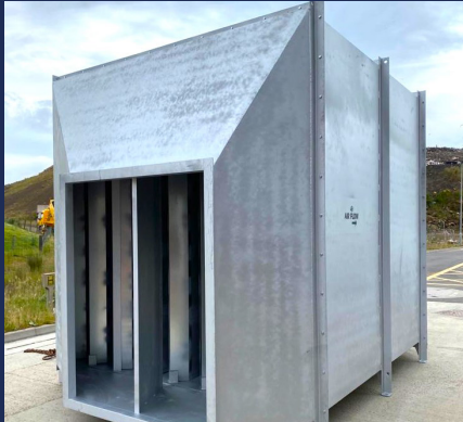
ATTENUATORS WITH TRANSITIONS