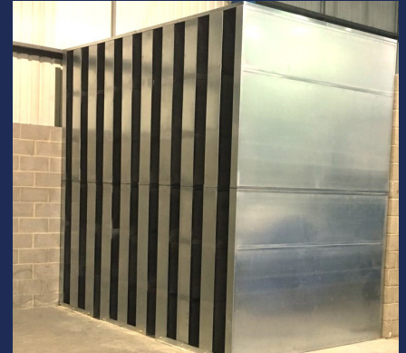
SITE-ASSEMBLED ACOUSTIC BAFFLES